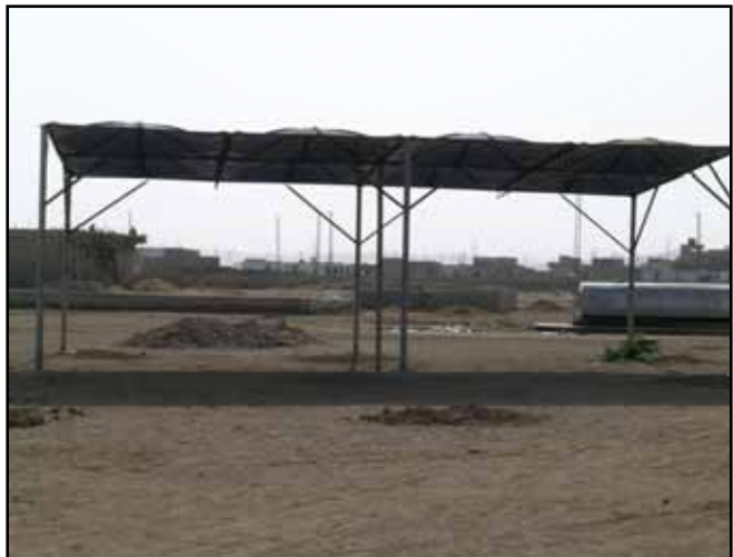
A mosque at resettlement site