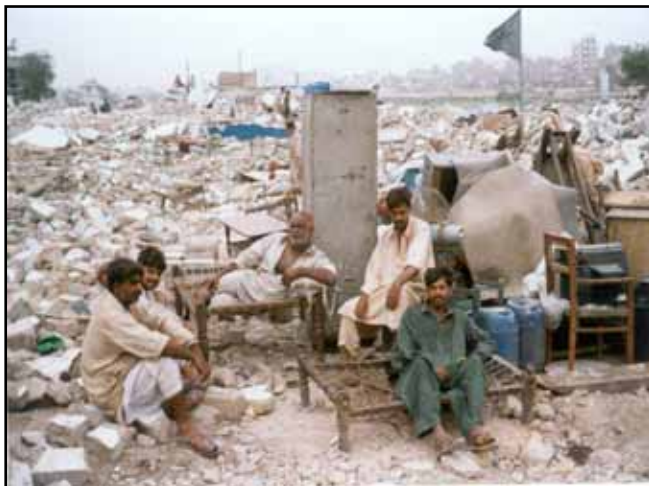
A family after demolition of their house