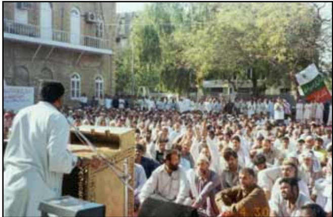
Protest against the government's plan