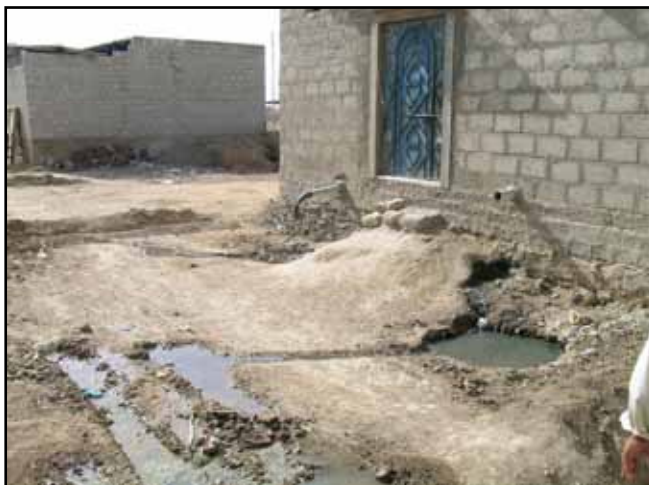
Sanitation conditions at new resettlement site