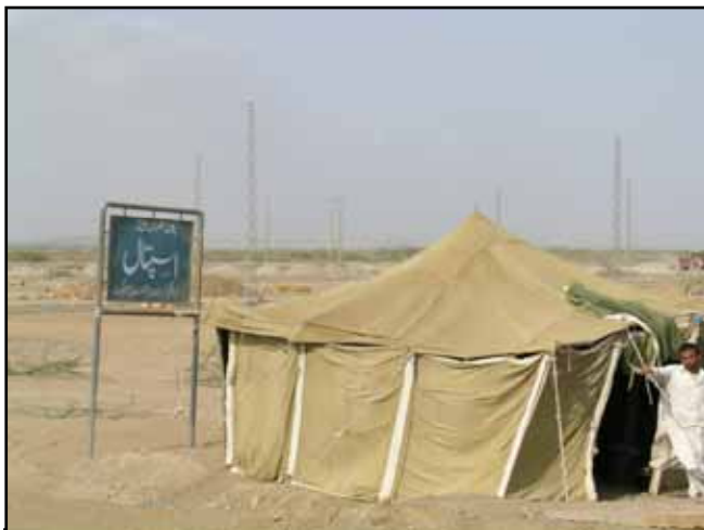
A site reserved for a hospital at the resettlement site, awaits commencement for construction

Under law people are not permitted to live in ecologically dangerous zones. However, experience tells us that many such zones can be made safe by the building of infrastructure and without causing ecological damage. A change in the law would facilitate the adoption of such a process for numerous communities living along river banks and natural drainage channels in Pakistan in general and in Karachi in particular.