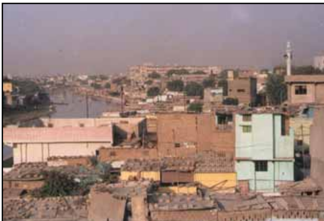
A settlement in Lyari Nadi before demolition

Surveys were carried out in settlements in a one-kilometre stretch along the northern bank of the Lyari River, which collectively contain approximately 2,000 houses. They comprise of both regularised areas as well as unauthorised katchi abadis ? (squatter settlements) and consist of the following.