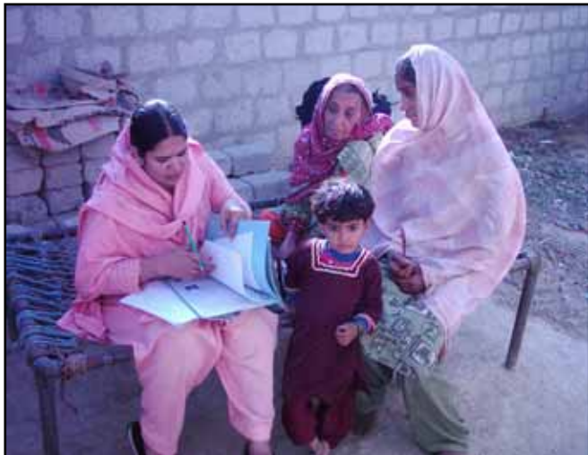
Interviews from the effectees

Identifying commercial units was a problem since very few of them had been established. It was difficult to work systematically with the commercial units which were marked for demolition as their owners were not willing to be interviewed. As such, their selection depended entirely on who was willing to respond.