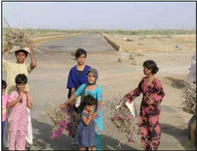
Hawks Bay: Collecting bushes for burning, as it will take more time to get house to house gas connections

Surveys of the Lyari settlements that are being demolished indicate that these are well established communities. The Residents chose to settle here because of the availability of jobs (since the area is next to major industrial zones) and to be near relatives and social sector facilities. Over the years they have formed community organisations, political affinities, linkages with the local power structure and with commercial organisations. As a result, they have been able to get assistance in getting jobs, negotiate freedom from police harassment, resolve family and neighbourhood disputes through mediation of local organisations, get loans in time of need and purchase household items on credit from neighbourhood shops.