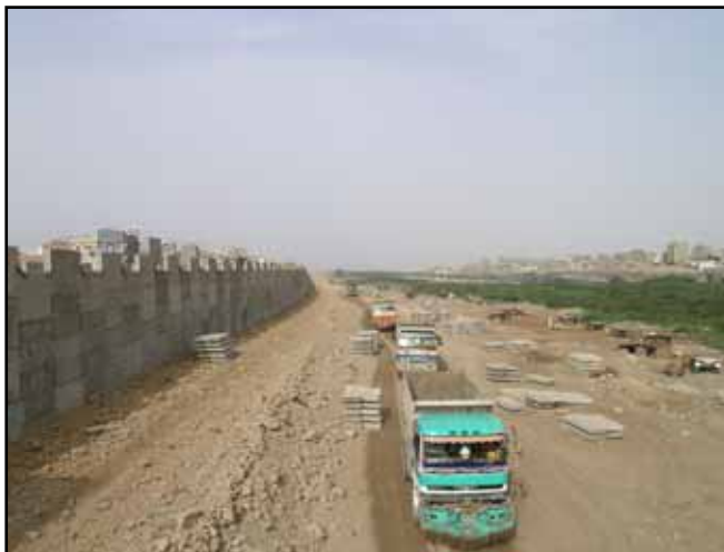
Construction of the expressway goes on

On the basis of the results of such a survey a resettlement plan that caused the minimum of social and economic hardship for the affectees could have been worked out with their participation. In addition, commercial units that were being demolished should have been compensated for rehabilitation at the relocation site and the nature of infrastructure and linkages with suppliers and labour that existed and which were required at the relocation site should have been clearly identified. On the basis of such a survey a support system for the commercial units could have been worked out.