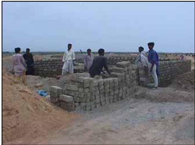
Rebuilding houses in Hawks Bay

The people resettled come mainly from areas on the northern bank of the Lyari river next to Sher Shah and Akbar Road. These areas have small scale industrial units both in the formal and informal sector. Many of these units have been demolished since they interfere with the alignment of the Expressway.