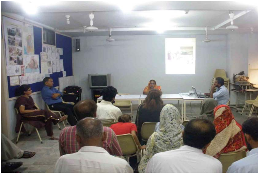
Activists from SAWERA Welfare Organization and Al-Rakhshi Welfare Services are making their presentations at a CBO workshop.