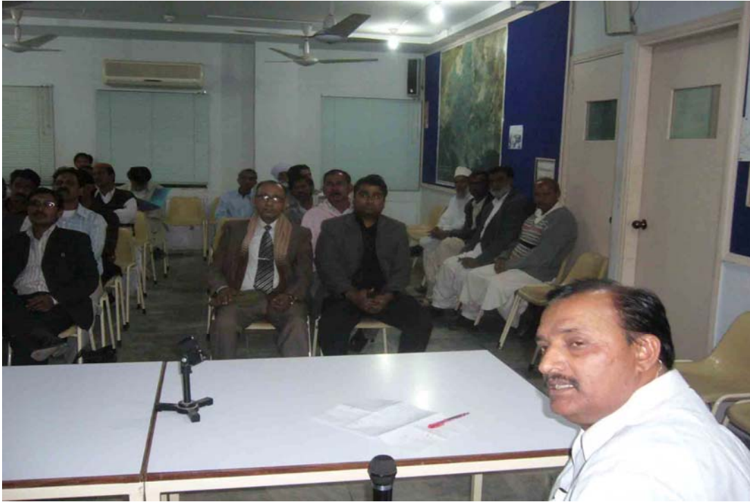
Community activists from Insaf Welfare Trust and Al-baraka Welfare Trust International are sharing work of their CBOs with the participants.