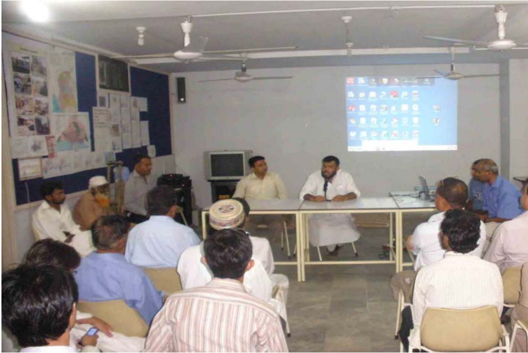
The activists from Humsafar Pakistan Welfare Association and Welfare Association Talent Citizens and Human Rights (WATCH) for special persons are presenting their works at the URC office.