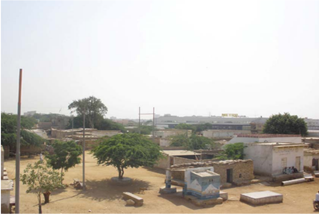
Madhu Goth located at University road adjacent to Safari Park is facing eviction threats. URC is conducting survey of such settlements.